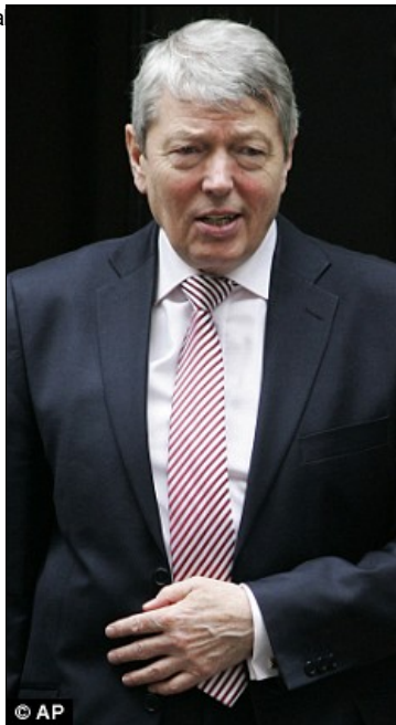
New Home Secretary Alan Johnson is to make his first major speech on crime today

Mr Johnson is also known to support early intervention to stop children going off the rails.