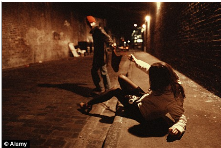
Britain has an even worse violence rate than South Africa (file picture)

The figures comes on the day new Home Secretary Alan Johnson makes his first major speech on crime, promising to be tough on loutish behaviour.